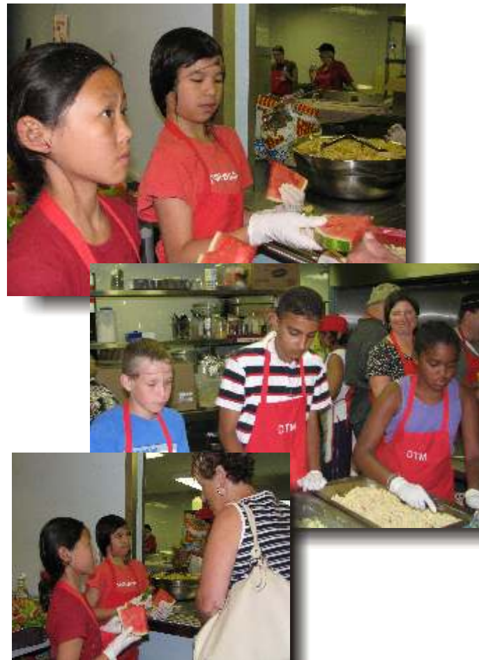
Students of Eastwood School serve lunch at the Mission

Start: Downtown Mission 664 Victoria Ave.